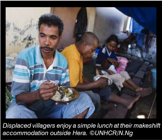
Displaced villagers enjoy a simple lunch at their makeshift accommodation outside Hera.

ployment was around 40%, and the country's Human Development Index ranks 142nd of 177 countries in the world.