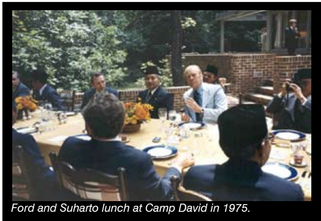
Ford and Suharto lunch at Camp David in 1975.

While Indonesian troops massacred civilians during the first hours of the Dec. 7