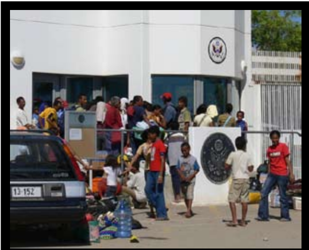
More than a thousand frightened Timorese sought refuge at the U.S. Embassy in Dili on April 29. Amb. Joseph Rees allowed them into the compound, but Washington was upset, so President Gusmão persuaded them to leave the following day.